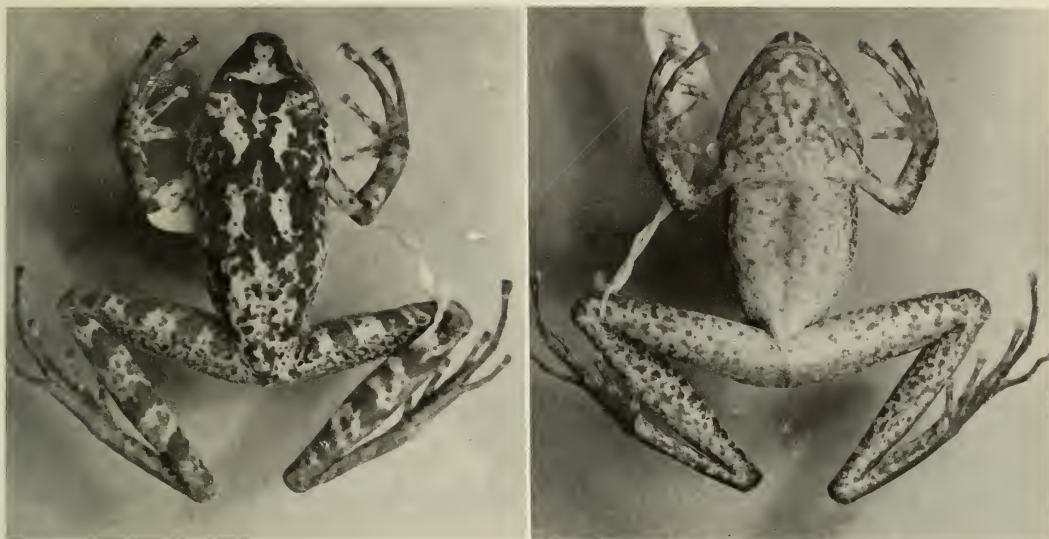
Fig. 3. Eleutherodactylus mercedesae , holotype, USNM 257848.

sally with irregular, light green splotches (spots look like moss) and few black marks; black eyestripe (canthal plus supratympanic stripe) and lip marks; limbs iridescent coppery with green marks; thighs and sides of body speckled cream, green, and brownish black; ventrally pearly yellow, mottled brown; iris gold (from field notes of M. S. Foster).